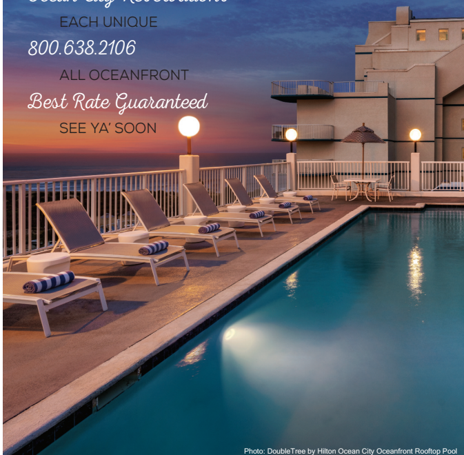
Photo: DoubleTree by Hilton Ocean City Oceanfront Rooftop Pool

RESORT AMENITIES OFFER SPACIOUS ALL-SUITE LUXURY UNITS W/JACUZZI TUBS, LARGE FULLY-EQUIPPED EFFICIENCY UNITS, COMFORTABLE GUESTROOMS, PRIVATE BALCONIES OR TERRACES, COMPLIMENTARY WIFI, HBO, DISNEY CHANNEL, OUTDOOR & INDOOR POOLS, HOT TUBS, JACUZZIES, TENNIS COURTS, EXERCISE ROOMS, TANNING BEDS, CHILDREN'S PLAY AREAS AND SUMMER KID'S ACTIVITIES, RESTAURANTS, POOL BARS & GRILLS, AND MUCH MORE. AMENITIES VARY AT DIFFERENT HOTELS. VISIT WWW.OCMDHOTELS.COM OR CALL 800-638-2106